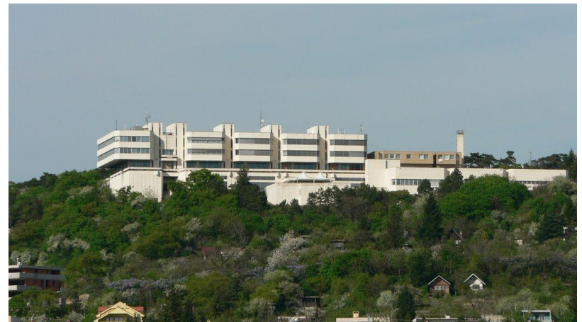
Venue of the ESPON meetings Hotel Bôrik, Bratislava