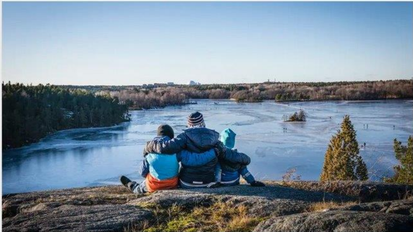
Så vart flyttar man när man lämnar Stockholm? Inte så långt bort, enligt SCB:s statistik.

Trenden i Sverige The trend continues: More people are moving from Stockholm than they are to