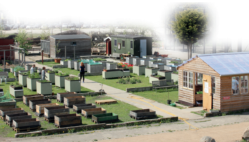
URBACT user network. Sundholm, Copenhagen.

Problems at city levels are always integrated and any actions to tackle them need to take into account local social, economic or environmental dimensions involving concerned citizens and local stakeholders. Through participating in the URBACT USER network,