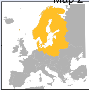
Map 2 - Net migration in the Baltic Sea Region 2005-2010

This map does not necessarily reflect the opinion of the ESPON Monitoring Committee