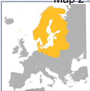
Map 2 - Net migration in the Baltic Sea Region 2005-2010

This map does not necessarily reflect the opinion of the ESPON Monitoring Committee