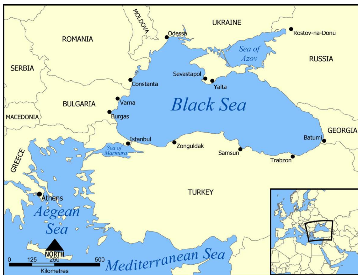
Map 2.1: the Black Sea Region

The roughly oval-shaped Black Sea occupies a large basin strategically situated at the southeastern extremity of Europe. The Black Sea is the largest, low tide, brackish-water intercontinental sea, bounded by Europe, Anatolia and the Caucasus, the most isolated from the World Ocean - connected to the Oceans via the Mediterranean Sea. The Bosphorus strait (which emerges from the sea's southwestern corner) connects it to the Sea of Marmara, and the strait of the Dardanelles connects Marmara Sea to Mediterranean Sea. The renowned Crimean Peninsula thrusts into the Black Sea from the north, and just to its east the narrow Kerch Strait links the sea to the smaller Sea of Azov (the Sea of Azov is not in the EU space). The Black Sea is very vulnerable to pressure from land based human activity and its health is equally dependent from the coastal and non-coastal states of its basin.