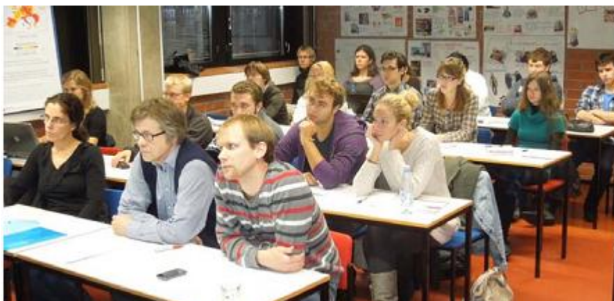
Audience of the postgraduate workshop in Joensuu