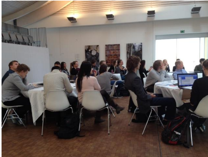
Audience at the ESPON-ENECON Postgraduate Workshop in Aalborg, Denmark.