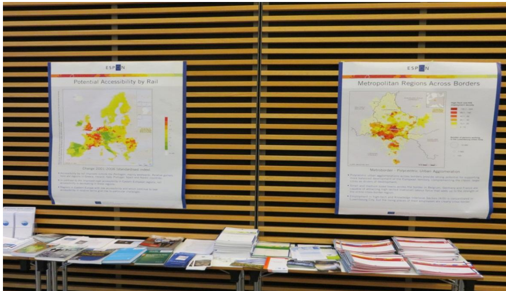
Throughout the conference there were exhibition and presentation of ESPON and ESPON material on site.