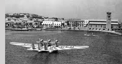
Air France 1927 (Megisti isle)