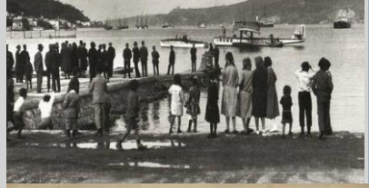
PATMO (Ege) - Atterramento di Idrovantoni nel Porto