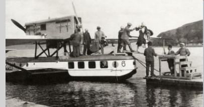
Aero Espresso Italiana, (Leros isle)