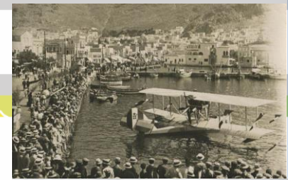
in the 30's (Rhodes isle)