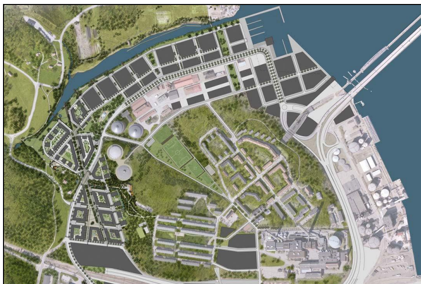
Figure 1: Stockholm Royal Seaport