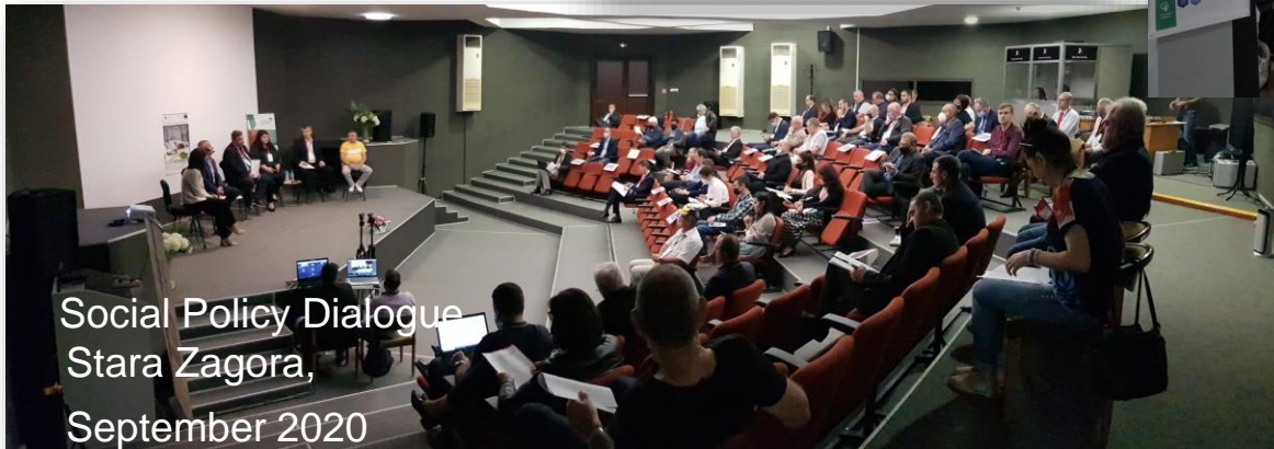
Social Policy Dialogue Stara Zagora, September 2020