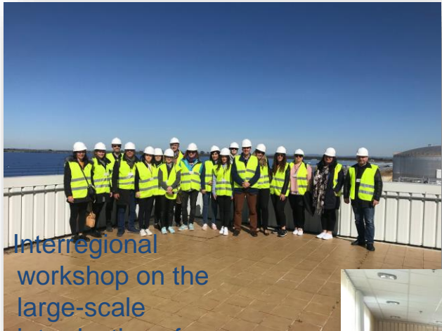
Interregional workshop on the large-scale introduction of renewables, Badajoz, Extremadura – March 2019