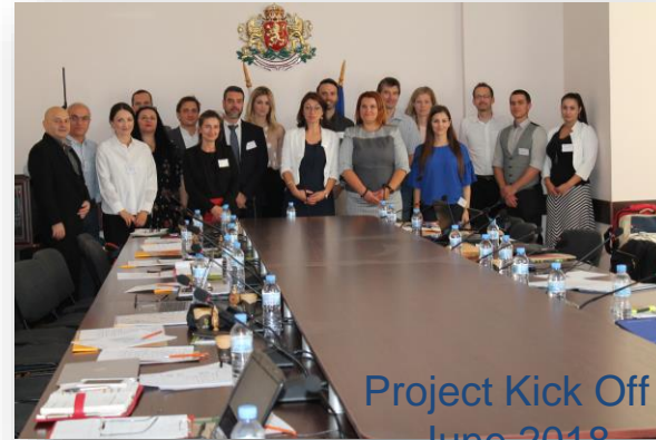
Project Kick Off Meeting, June 2018