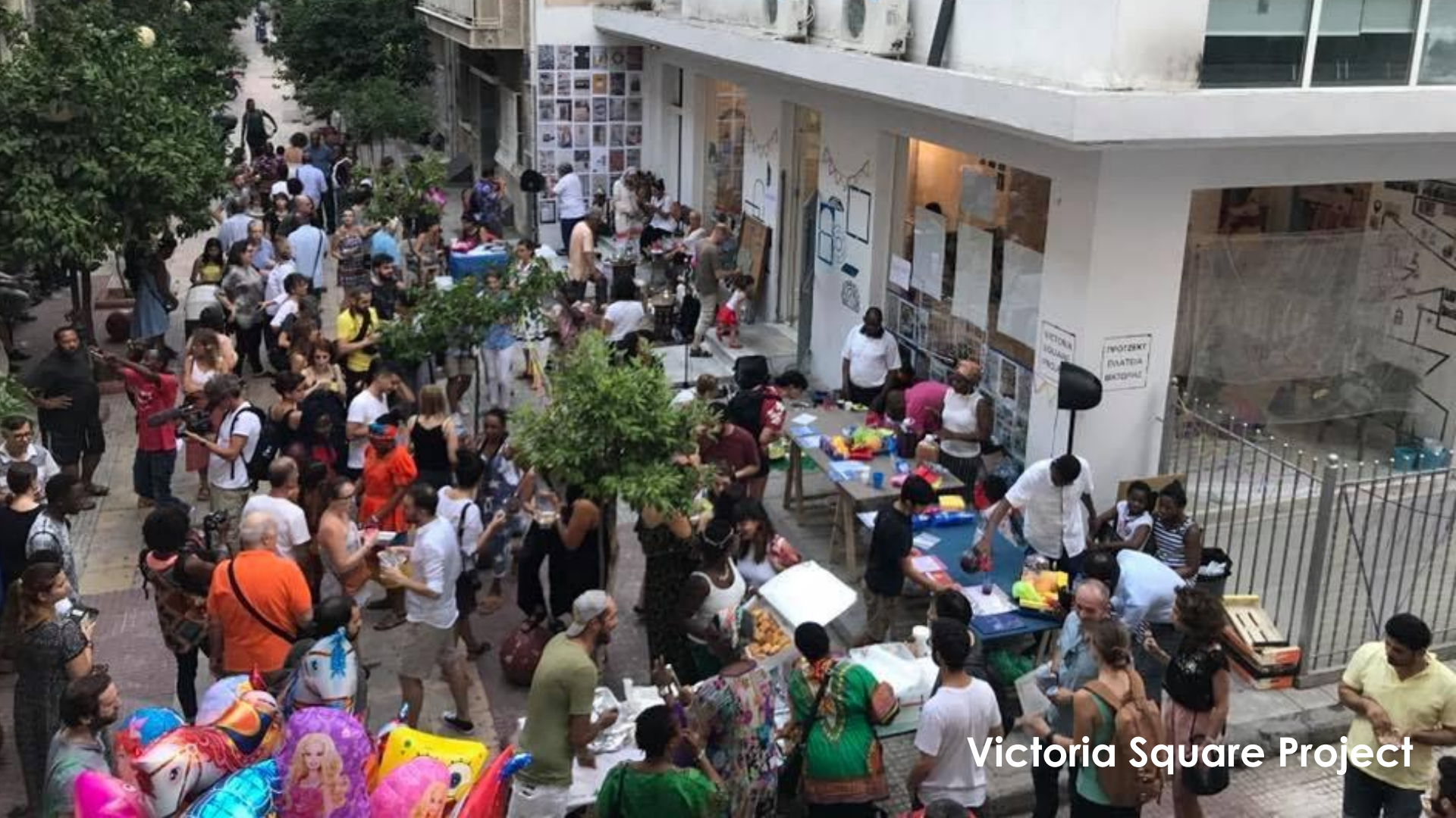
Victoria Square Project