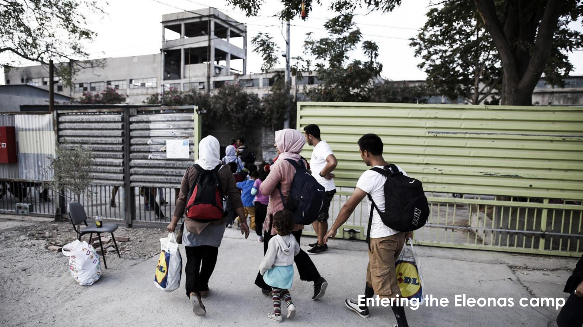
Entering the Eleonas camp