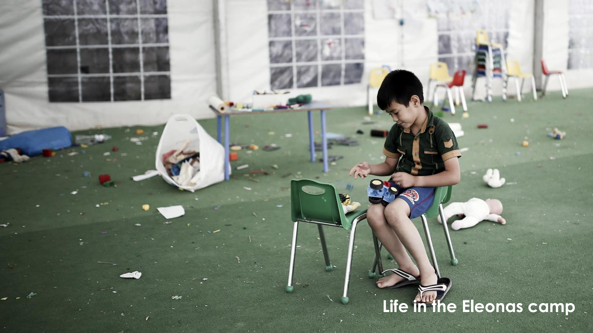
Life in the Eleonas camp