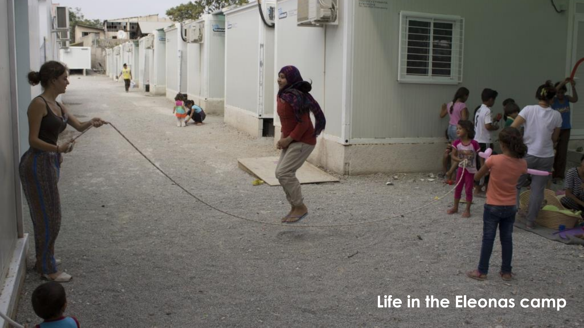
Life in the Eleonas camp