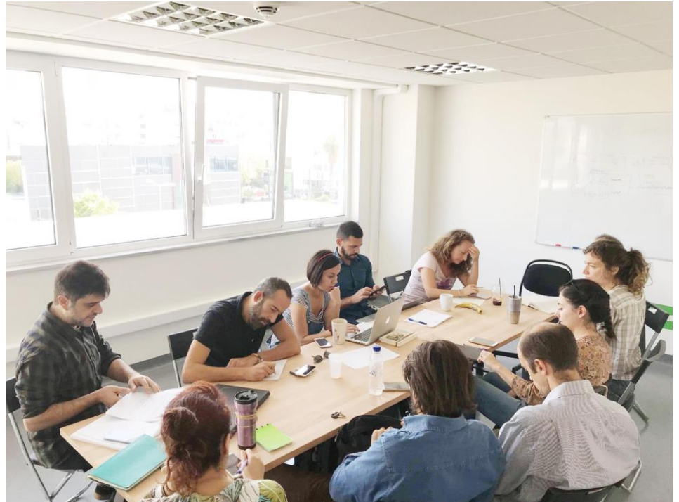
co-designing with community groups' leaders