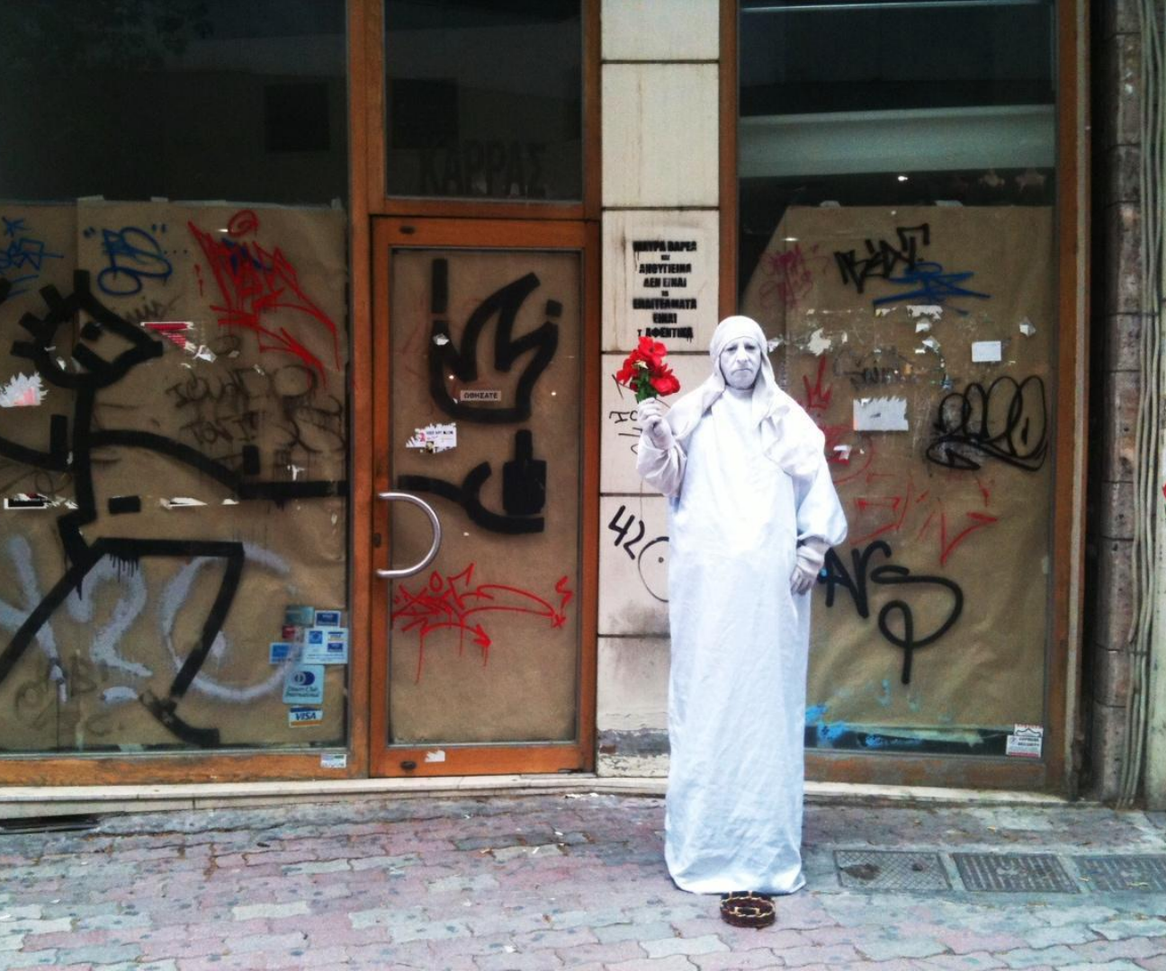
Vacant properties in the center of Athens