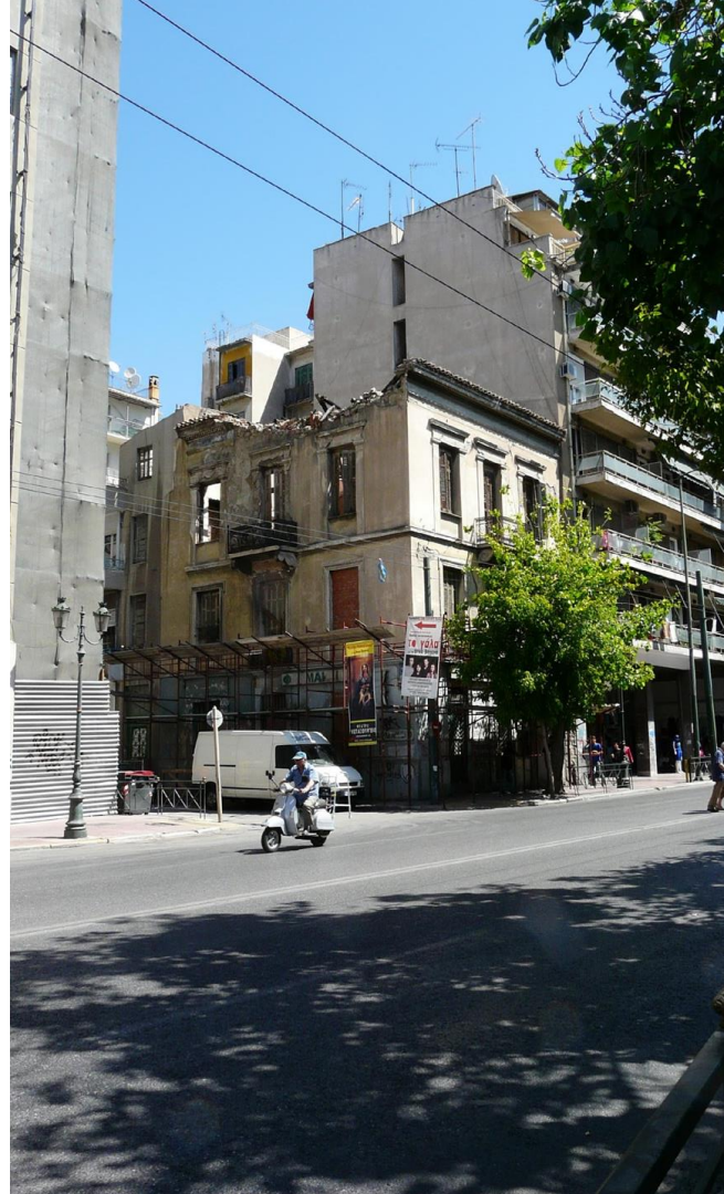
Vacant properties in the center of Athens