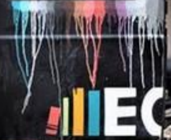
ECHO Refugee Library

ΚΙΝΗΤΗ ΒΙΒΛΙΟΘΗΚΗ Pirûkxan کتابخانه سیار