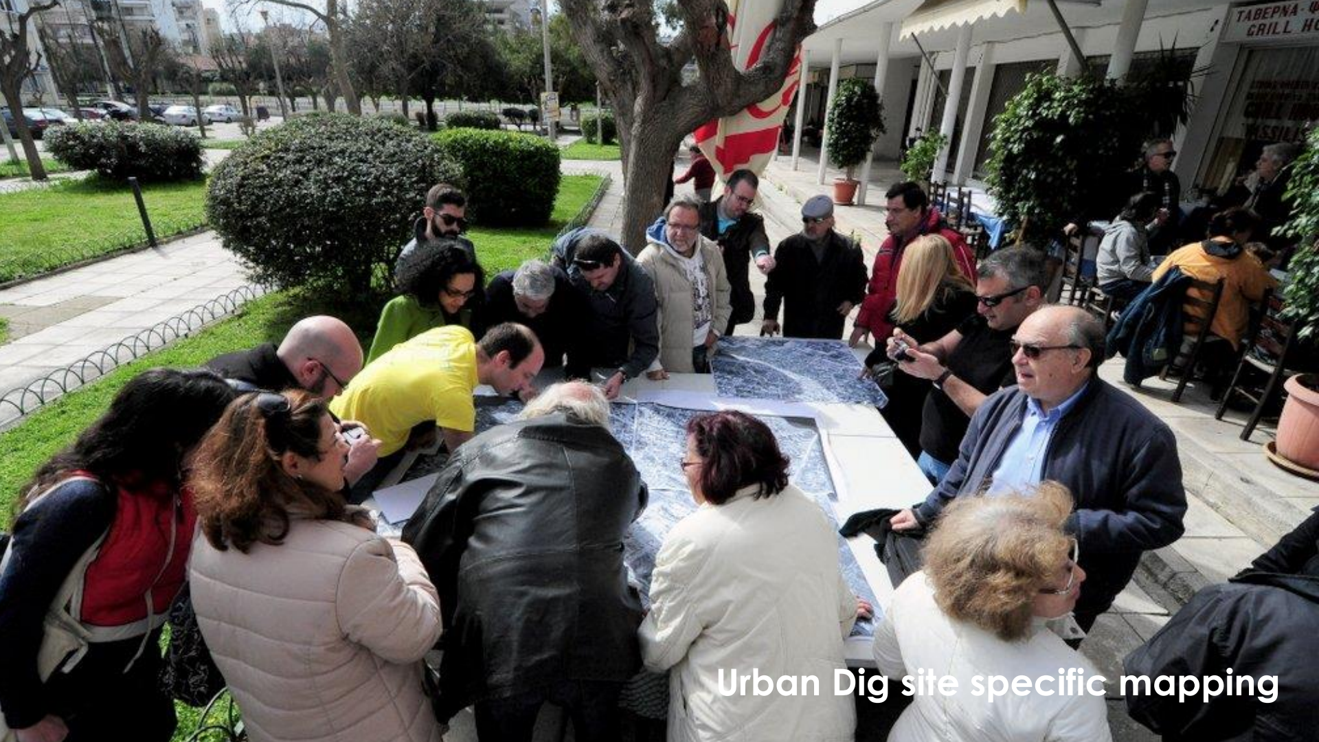
Urban Dig site specific mapping