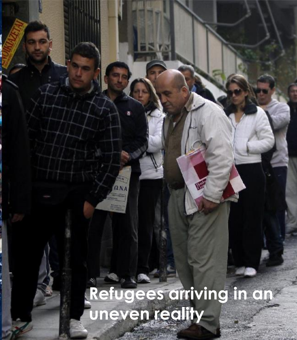
Refugees arriving in an uneven reality