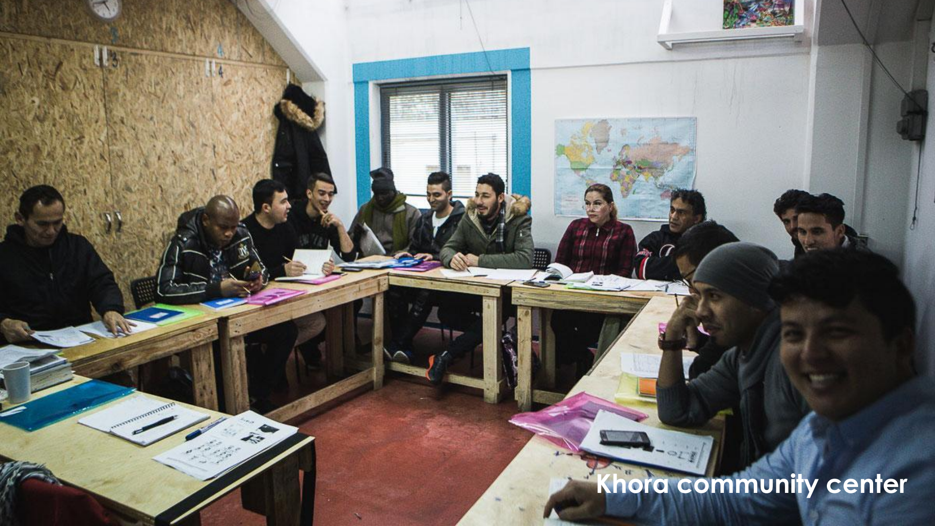
Khora community center