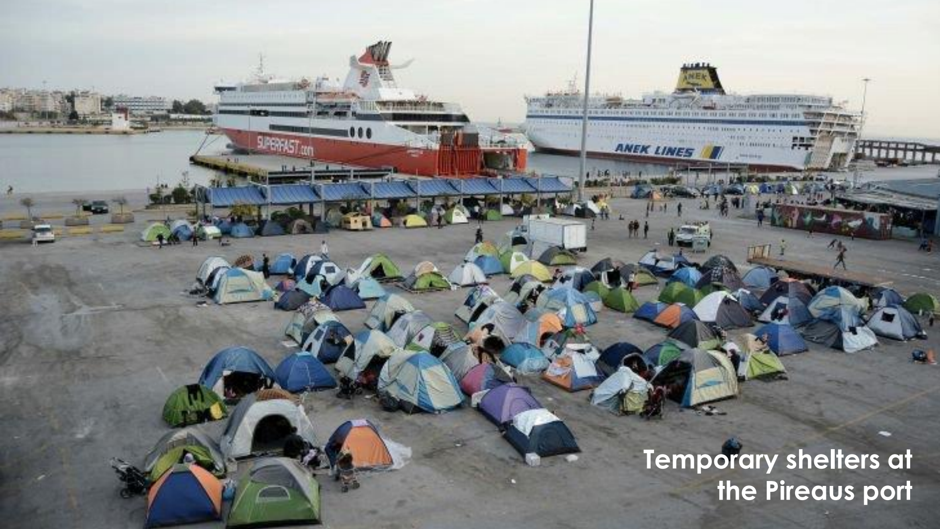
Temporary shelters at the Piraeus port