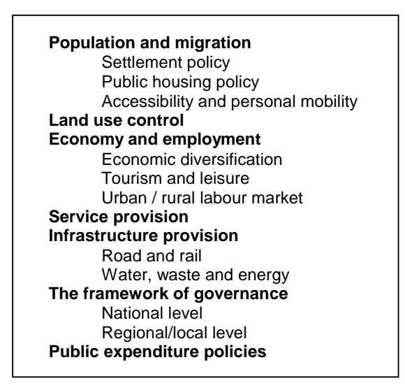
Review of Policy Development at the EU Level

At this stage, in the absense a fully developed framework for analysis of urban-rural dynamics, the WP4 made a provisional review of relevant policy areas. This review will need reformulating and reinterpreting as the project develops. The key policy themes at this stage were: